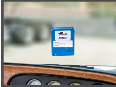
Fusion (PrePass Plus) Transponder